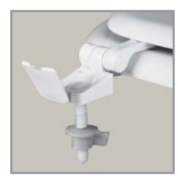
NON-CORROSIVE BOLTS AND WING NUTS