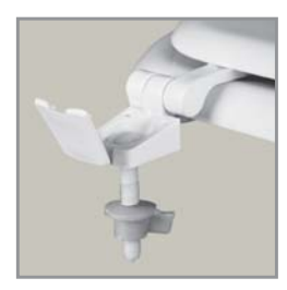
NON-CORROSIVE BOLTS AND WING NUTS